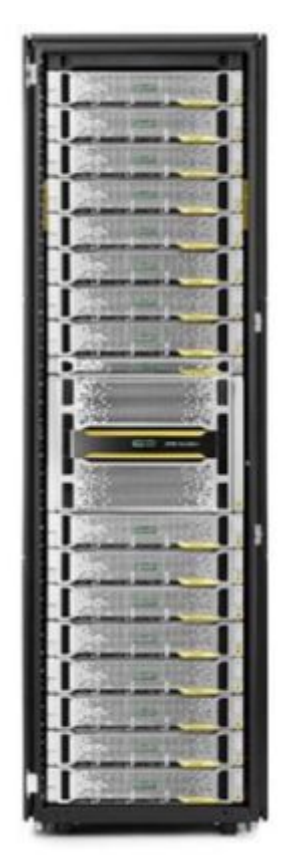
HPE 3PAR StoreServ 9000 Storage

The HPE 3PAR StoreServ 9000 Storage is an enterprise-class flash array that helps you consolidate primary storage workloads - for file, block, and object offering flexible IO host connectivity - without compromising performance, scalability, data services, or resiliency. This newest 3PAR model based on the proven 3PAR architecture is purpose built for all-flash consolidation, delivering the performance, simplicity, and agility needed to support your hybrid IT environment. HPE 3PAR StoreServ 9000 Storage is available in a single all-flash model, the 9450, that offers rich Tier-1 data services, quad-node resiliency, fine-grained Quality of Service (QoS), seamless data mobility between systems, high availability through a complete set of persistent technologies, and simple and efficient data protection with a flat backup to HPE StoreOnce Backup appliances.