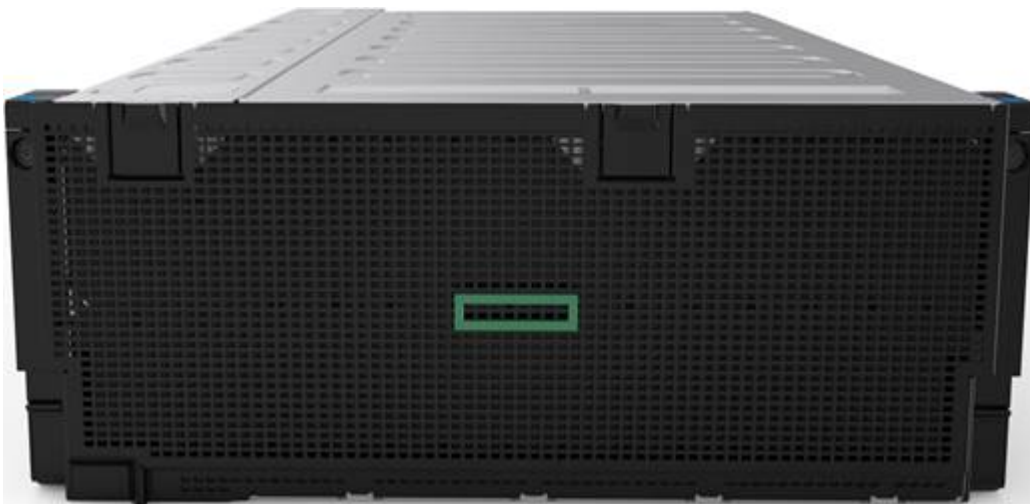
HPE D8000 Disk Enclosure Front View

The D8000 Disk Enclosure can be connected to ProLiant Gen10 servers using the HPE Smart Array E208e-p SR Gen10 Controller or the P408e-p SR Gen10 Controller. Two D8000 enclosures can be daisy-chained together to provide support for up to 211 drives.