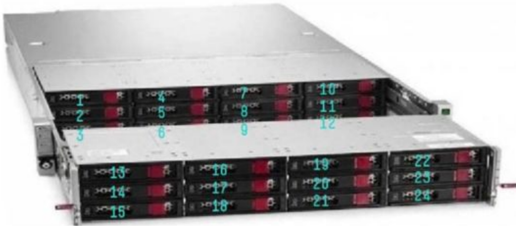
HPE StoreEasy 1650 Expanded Storage - Front View

HPE StoreEasy 1650 Expanded Storage products offers revolutionary storage density, with more than double storage use cases in a 2U form factor. Eight or six-core processing (depending on model selected), up to 280 expandability enhance this ultra-dense 2U storage solution for small, medium, or large IT environments. Store Server 2016 pre-installed on two M.2 Solid State Disks in internal PCIe slot. The StoreEasy 1650 Expanded S includes a rail kit and cable management arm.